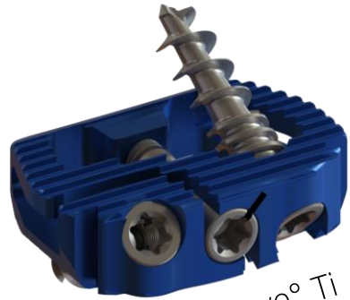
C-Curve° Ti Expandable